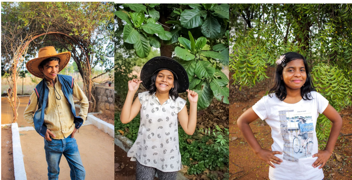
Having a little fun with the camera on a day off.

It was a year of transition and change. We look forward to a successful year ahead.